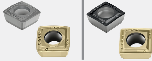
E57 – The universal geometry