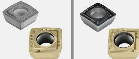
A57 – The strong geometry